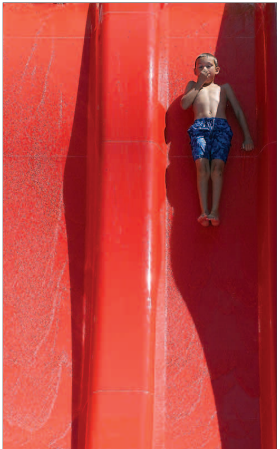
A boy splashes down a waterslide during a hot Saturday, at the grand opening of Souris’ $1.2 million new pool.

The “lazy river,” a circular section of the pool that takes swimmers around in a slow